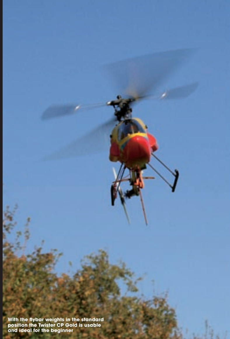
With the flybar weights in the standard position the Twister CP Gold is usable and ideal for the beginner

model alive a bit more. The model actually offers adjustments on the flybar with flybar weights that when moved more inboard offer a little more response suitable for flipping around and aerobatics. This is documented in the instructions.