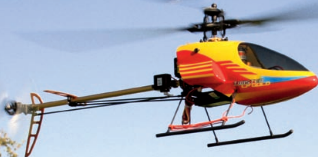
The Twister CP Gold comes ready to fly straight out of the box