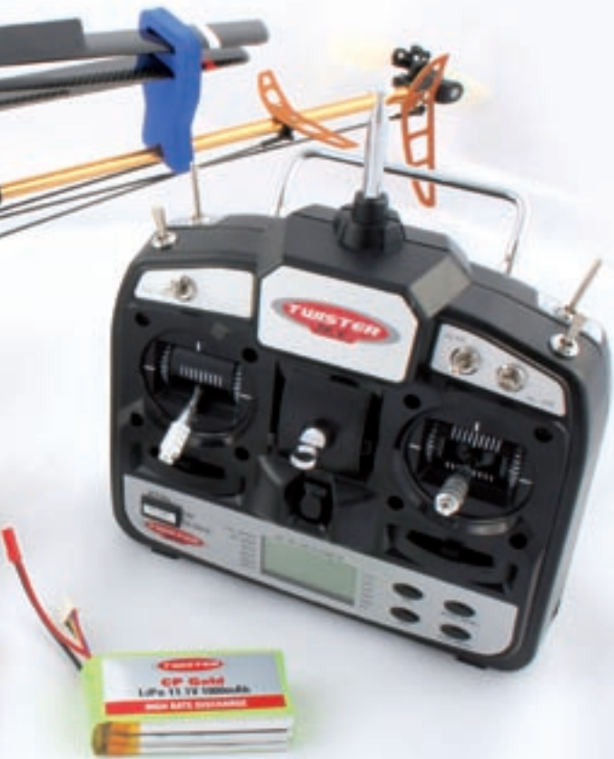
The complete kit as supplied: Twister CP Gold RTF helicopter, 35MHz transmitter, LiPo and charger, and even eight AA batteries for the radio