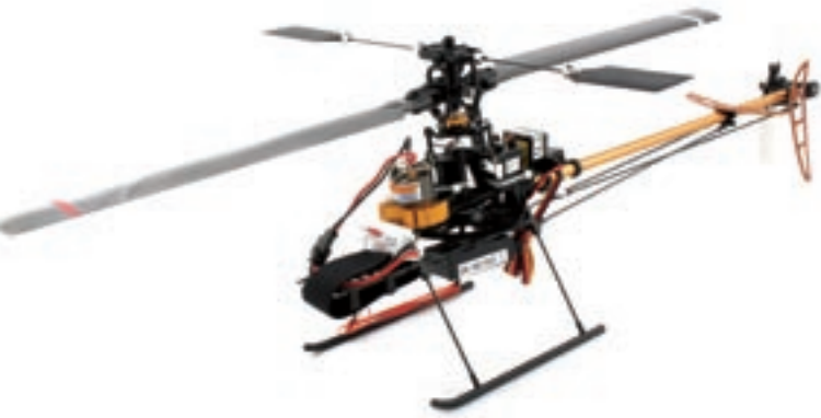
Under the skin you will find a very compact and well made machine