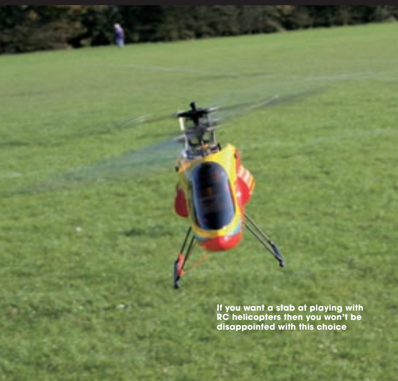
If you want a stab at playing with RC helicopters then you won't be disappointed with this choice

not intended for this purpose in this set-up, so it's not a bad thing.