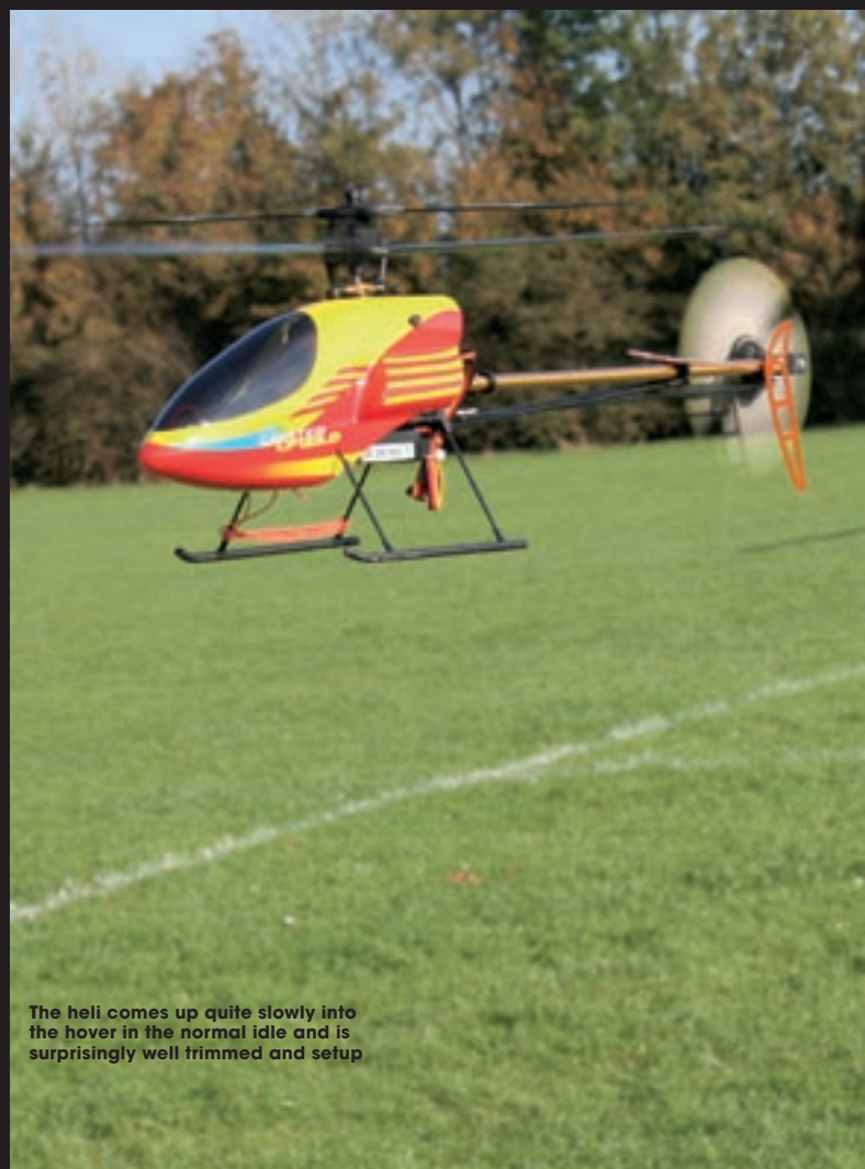
The heli comes up quite slowly into the hover in the normal idle and is surprisingly well trimmed and setup

To be honest I never tried it, the model didn't inspire the confidence it was going to get around the loop in time to be able to feed in the negative in time. To be honest it was