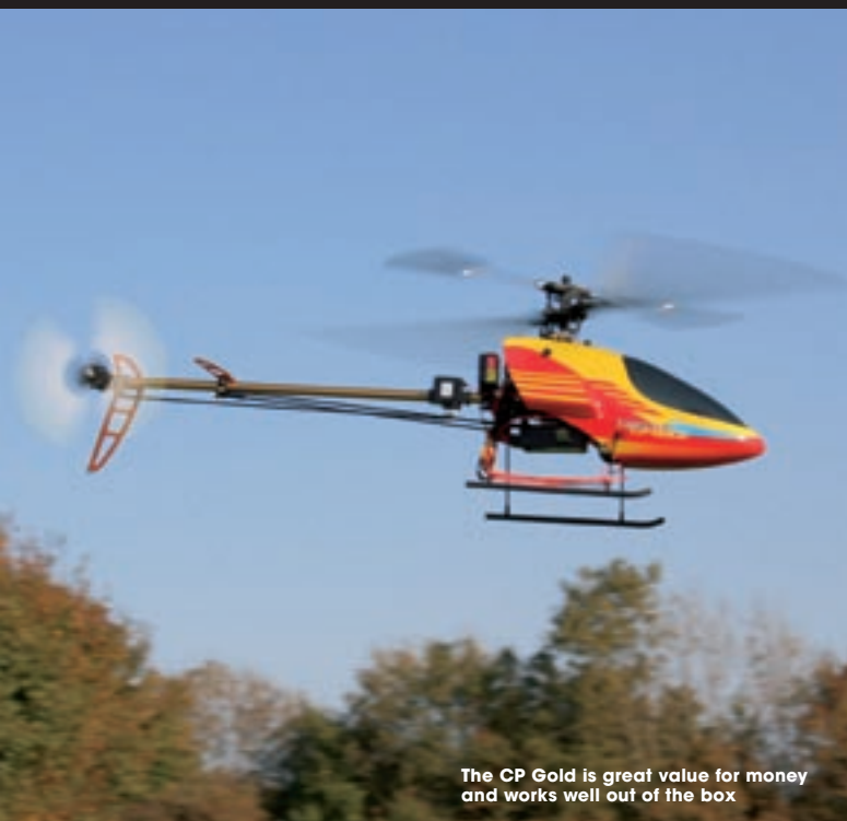
The CP Gold is great value for money and works well out of the box