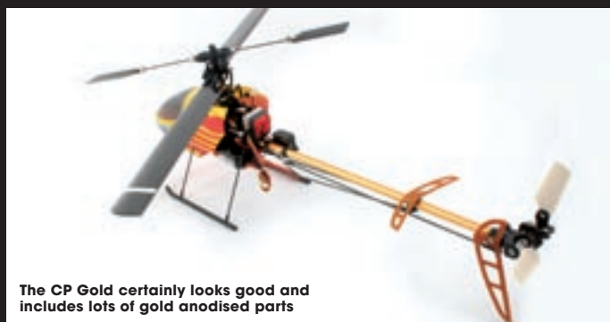
The CP Gold certainly looks good and includes lots of gold anodised parts